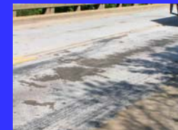
Wake County SR 1010 over US 1