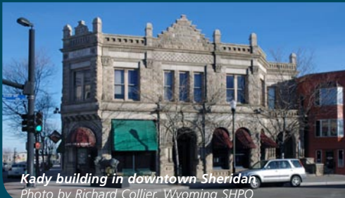
Kady building in downtown Sheridan