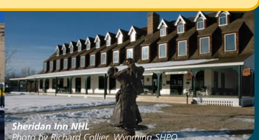
Sheridan Inn NHL